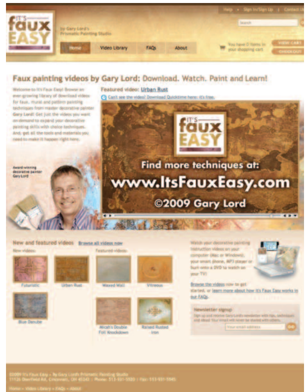
Gary Lord’s website It’s Faux Easy features a wealth of downloadable videos.

DVD. Apple, Amazon Video on Demand, Netflix, Hulu and many other companies are selling downloads or subscriptions for video or music. It can be done, and valuable content